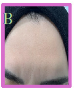
Figure 1: Ideal candidate for botulinum toxin treatment demonstrating Frontal view of a 33-year-old female presenting with (A) dynamic frown lines with glabellar complex muscle contraction (B) lack of wrinkles static lines with glabellar muscles at rest.

The patient was quite satisfied with the appearance, and therefore no additional injections were applied.