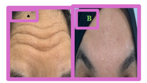
Figure 2: Ideal candidate for botulinum toxin treatment demonstrating Preoperatively, wrinkles horizontal lines with severe dynamic wrinkles over her forehead contraction (B)one month Postoperatively, showing lack of static lines with frontalis muscles at rest with no Wrinkles after injection.

Four weeks following the botulinum toxin showing lack of static lines with frontalis muscles at rest with no Wrinkles. The patient was quite satisfied with the appearance, and therefore no additional injections were applied. Eighth weeks Postoperatively, showing lack of static lines with frontalis muscles at rest with no Wrinkles after injection. Lack of wrinkles static lines with glabellar muscles at rest. The patient was quite satisfied with the appearance, and therefore no additional injections were applied as showing in fig 2,3,4 and 5.