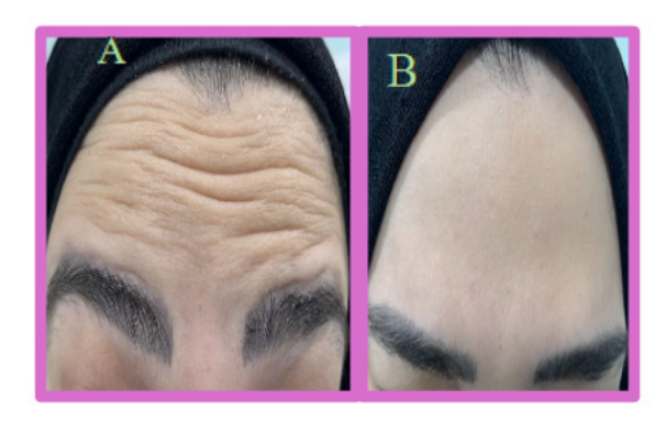
Figure 5: Case 2 A) Frontal view of a 32-year-old female presenting severe forehead wrinkles in the upper forehead when animated with severe dynamic wrinkles over the entire forehead. (B) Four weeks following the botulinum toxin showing lack of static lines with frontalis muscles at rest with no Wrinkles.

The patient was quite satisfied with the appearance, and therefore no additional injections were applied.